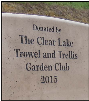
Westside Park Lakeport, CA