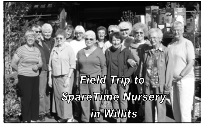
Field Trip to SpareTime Nursery in Willits