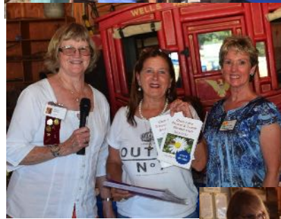
CGCI District Mtg at Ely Stage Stop & Museum